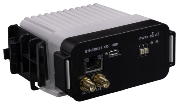
Fig. 1. INSIDE Connect router.

The router has a DIN rail adapter. The router has, among others, support for DHCP server, NAT (Network Address Translation), NAT-T and Port Forwarding. When connected to a local network, local IT security is taken into consideration and safeguarded. Connection to a local network occurs outside of INSIDE Connect and comes under the local IT-department's responsibility.