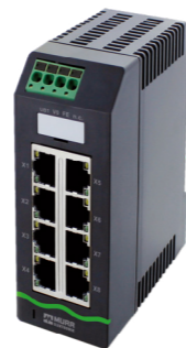
Fig. 2. Switch (accessory).

The external antennas are IP65/67-classified and can be installed both indoors and outdoors. If there is a need to connect additional products to the router, INSIDE Connect can be supplemented with a switch (max 7 devices in total). The switch is equipped with a DIN rail adapter. The Electrical cabinet accessory can be chosen when INSIDE Connect needs to be mounted outdoors or in other harsh environments.