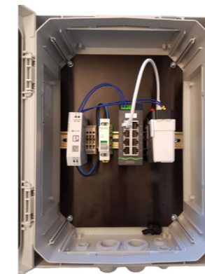
Fig. 6. INSIDE Connect in electrical cabinet with switch.

INSIDE Connect is approved for outdoor installation with the Electrical cabinet accessory.