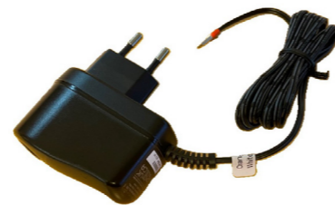
Fig. 3. Power supply unit (accessory).